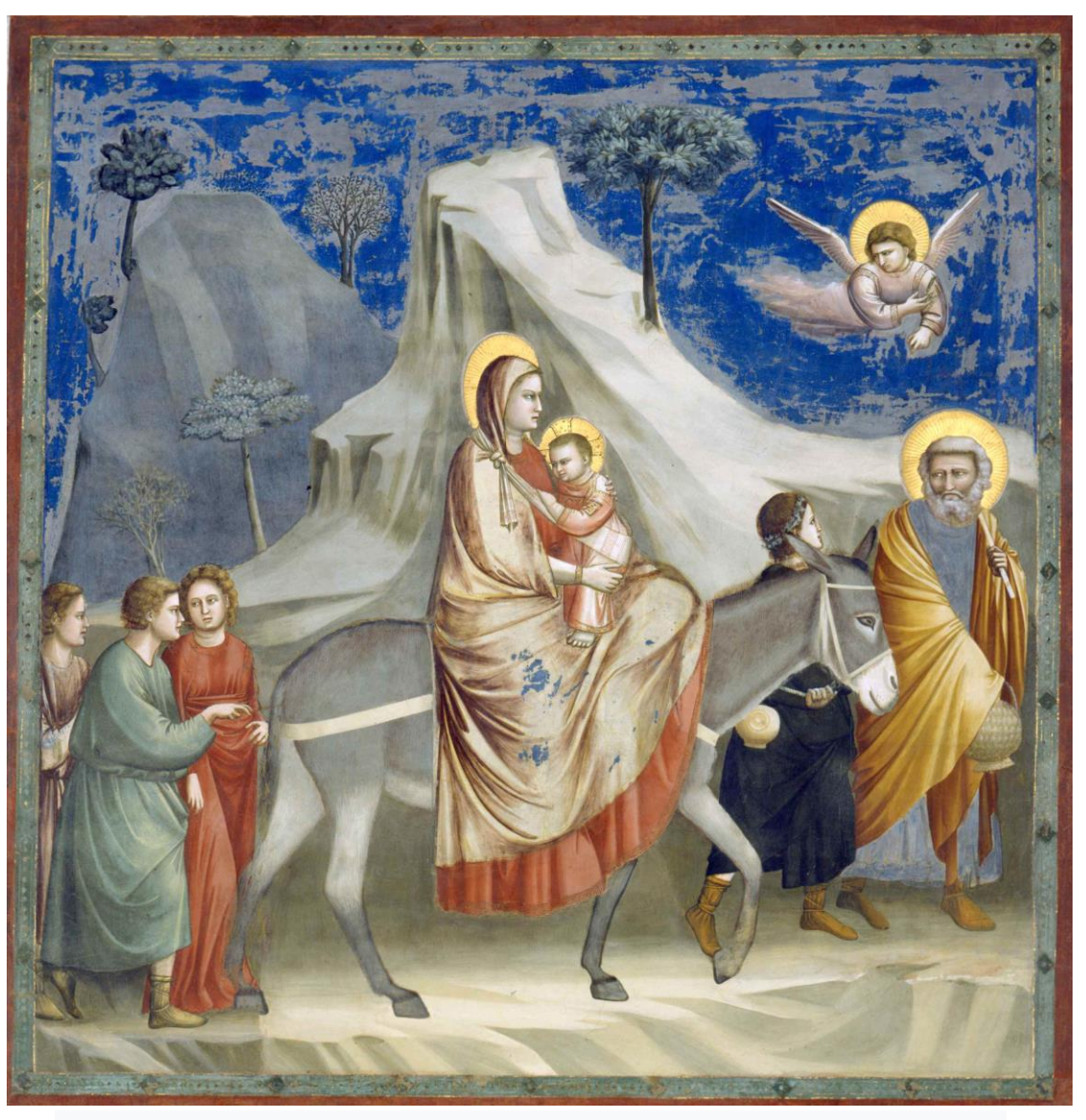
The Flight into Egypt by Giotto di Bondone (1304–1306, Scrovegni Chapel, Padua)