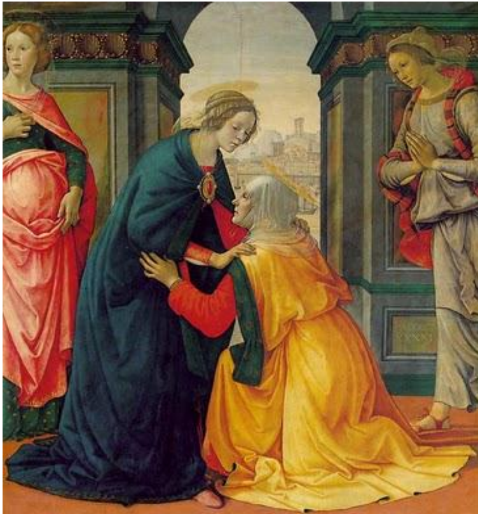
Visitation by Ghirlandaio